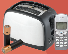
Electricals and batteries

Textiles and clothes (WE CAN NO LONGER ACCEPT BAGGED OR LOOSE TEXTILES)