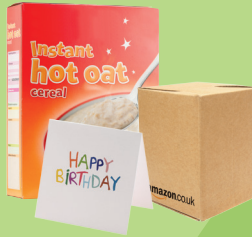
Cardboard, clean food packaging, boxes and cards