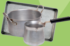
Metal pots, pans and trays