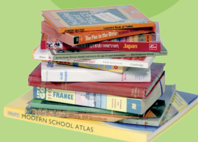
Books, paperback and hardback