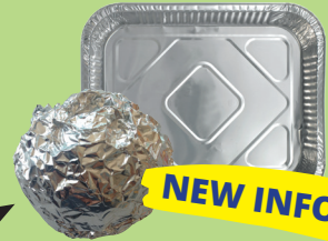
Aluminium foil (ROLL YOUR FOIL INTO A TENNIS BALL SIZE)