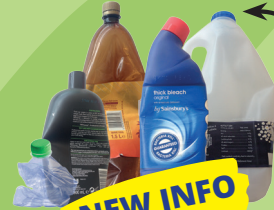
Plastic bottles and tops (WASH, SQUASH AND PUT THE TOP BACK ON)