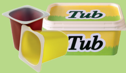
Plastic pots, tubs and food trays