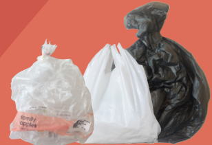
Plastic bags and film