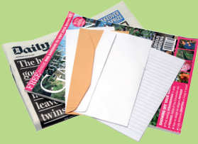
Paper, newspapers, magazines and junk mail