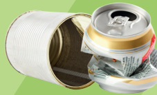
Steel and aluminium cans