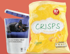
Crisp packets and food pouches