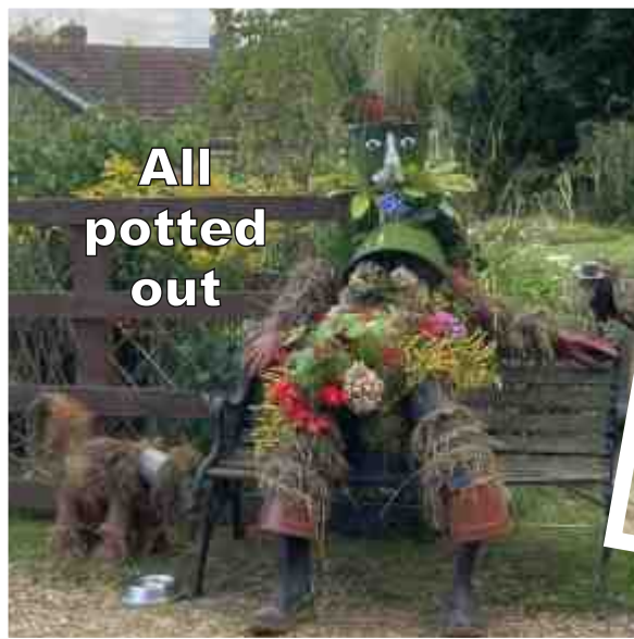
All potted out