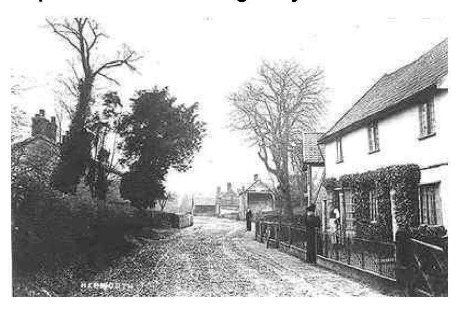
The Shop and Street Hepworth – 1908

Some present cities, towns, and villages in this country make much of the fact of having been included in William the First's surveys of England in 1086 and 1087 when he wanted to know the extent and taxable value of the land. There are two volumes of the results, the Great Domesday and, of course, the Little Domesday. The first of these covered all of the country except for Essex, Norfolk and Suffolk, and for some reason London and Winchester were completely left out. As they were the two main cities of the land, perhaps there were already records of their value. The three Counties omitted were put in the second volumes. Perhaps the inhabitants were more resistant and obtuse when they learned the reason for the visitations? Whilst Hepworth is certainly included in the Domesday Book, as it is known, we can claim to having a much older settlement in this small valley, which is not much more than a dip in the ground but I suspect that a stream ran along it and the surrounding woods would have provided the meat and veg. Certainly the Romans found it to their liking as much of their pottery has been found here in recent times