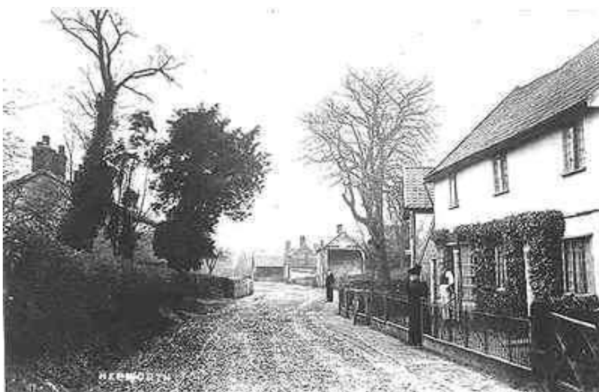
The Shop and Street Hepworth – 1908

Some present cities, towns, and villages in this country make much of the fact of having been included in William the First's surveys of England in 1086 and 1087 when he wanted to know the extent and taxable value of the land. There are two volumes of the results, the Great Domesday and, of course, the Little Domesday. The first of these covered all of the country except for Essex, Norfolk and Suffolk, and for some reason London and Winchester were completely left out. As they were the two main cities of the land, perhaps there were already records of their value. The three Counties omitted were put in the second volumes. Perhaps the inhabitants were more resistant and obtuse when they learned the reason for the visitations? Whilst Hepworth is certainly included in the Domesday Book, as it is known, we can claim to having a much older settlement in this small valley, which is not much more than a dip in the ground but I suspect that a stream ran along it and the surrounding woods would have provided the meat and veg. Certainly the Romans found it to their liking as much of their pottery has been found here in recent times