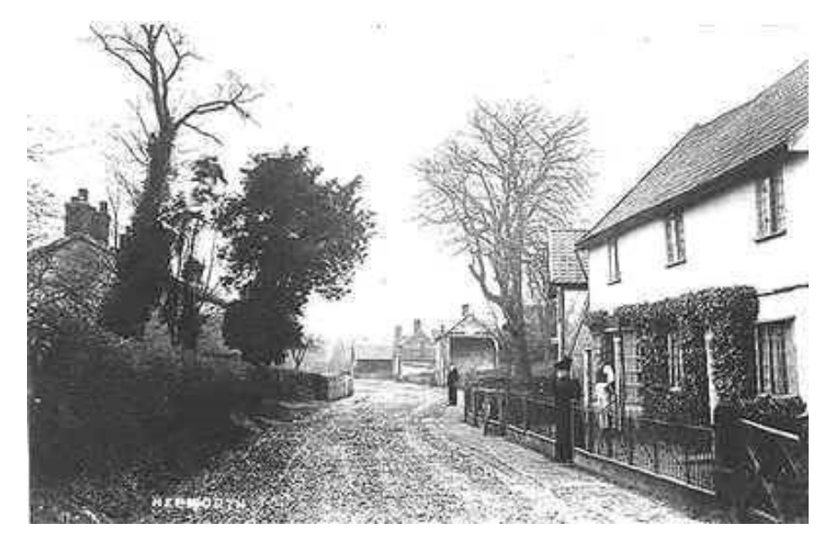
The Shop and Street Hepworth – 1908

Some present cities, towns, and villages in this country make much of the fact of having been included in William the First's surveys of England in 1086 and 1087 when he wanted to know the extent and taxable value of the land. There are two volumes of the results, the Great Domesday and, of course, the Little Domesday. The first of these covered all of the country except for Essex, Norfolk and Suffolk, and for some reason London and Winchester were completely left out. As they were the two main cities of the land, perhaps there were already records of their value. The three Counties omitted were put in the second volumes. Perhaps the inhabitants were more resistant and obtuse when they learned the reason for the visitations? Whilst Hepworth is certainly included in the Domesday Book, as it is known, we can claim to having a much older settlement in this small valley, which is not much more than a dip in the ground but I suspect that a stream ran along it and the surrounding woods would have provided the meat and veg. Certainly the Romans found it to their liking as much of their pottery has been found here in recent times