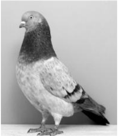
An example of a Tippler Pigeon. They come in many colours and patterns

Now on my paper round I would pass proper pigeon lofts that had racing pigeons. When I saw these I wanted some. As my passion increased my Dad had given me part of his workshop/shed at the bottom of the garden and built me a lovely aviary on the front. My first proper racing pigeons were strays that other pigeon fanciers didn't want. I would seek out other pigeon men in my home town of Barking and stand out in the street in awe of these racing pigeons flying round. My paper round money would pay for their feed. In todays money 75p for the